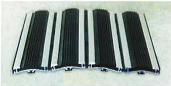
10mm Open Construction

Available in closed construction in 10mm and 16mm depths, and Open Slimline construction in 10mm depth only. The Open Slimline version is linked with a perforated joining strip to allow for drainage.