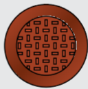
Terracotta PMS: 174C