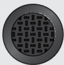
Black Process Black