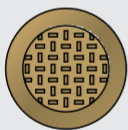
Beige PMS: 465C